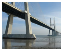
Vasco da Gama Bridge (PT)