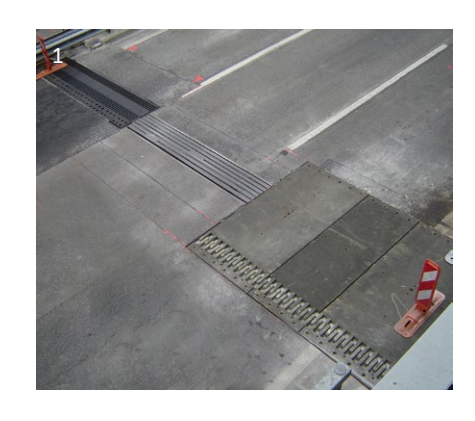
Illustration of step-by-step joint replacement

(behind), with the help of the "Mini-Fly-Over"