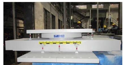
One of the RESTON®SWIVEL bearings after production

City: Colombo Country: Sri Lanka Type: Steel sky bridge Length: 54 m Owner: WelcomHotels Lanka (Private) Limited Contractor: Larsen & Toubro Limited, Chennai Construction Engineer: Sterling Consultant Services, Mumbai