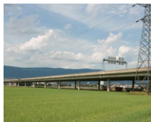
Viaduct Yverdon (CH)