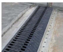
Sliding finger joints