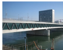
Dreirosen Bridge (CH)