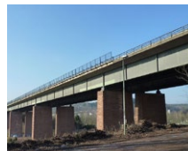
Lautertal Bridge (DE)