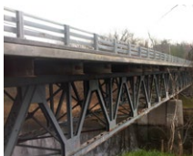
Route 9G (USA)