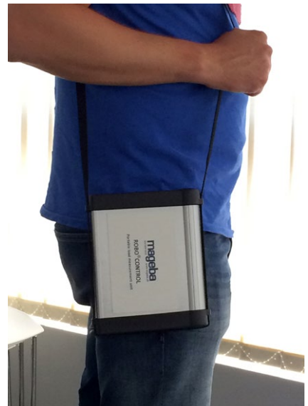
Portable measurement unit