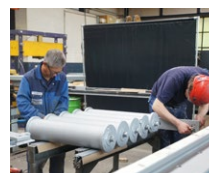
Repair and Replacement