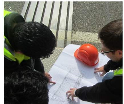
1 mageba team preparing for an inspection 2 On-site status analysis of bridge bearings 3 On-site inspection of an expansion joint