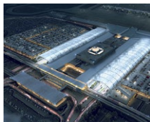
Atlanta Airport (US)