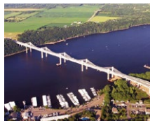
St. Croix Bridge (US)