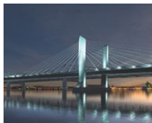
Ohio River Bridge (US)