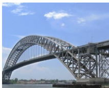
Bayonne Bridge (US)