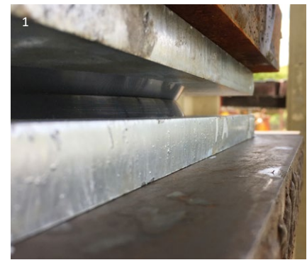
1 Testing of a disc bearing to 150 % proof load, per AASHTO LRFD specifications.

You can also find further product information, including data sheets with standard bearing dimensions and reference lists, at mageba-group.com .