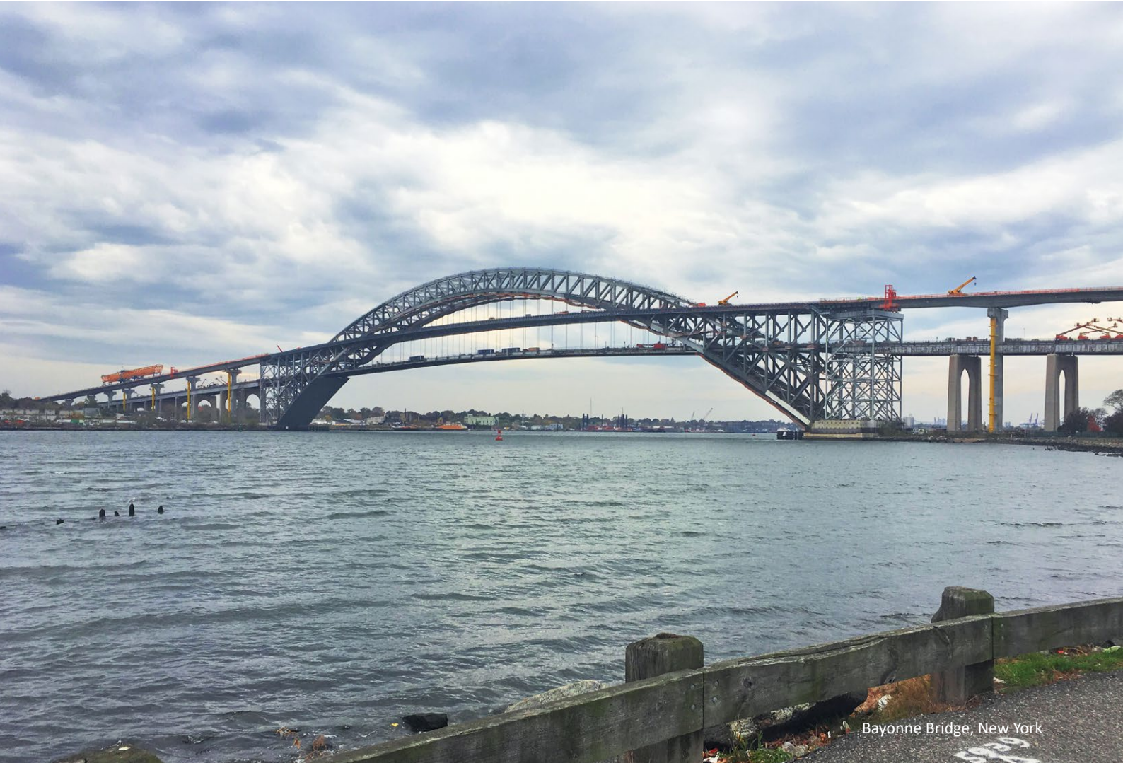
Bayonne Bridge, New York