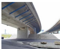
Pont sur le Buron (CH)