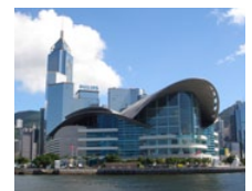
Conference Centre (HK)