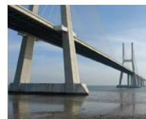
Vasco da Gama Bridge (PT)