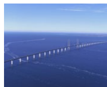
Øresund Bridge (DK/SE)