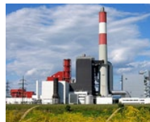
Thaiss Power Plant (AT)