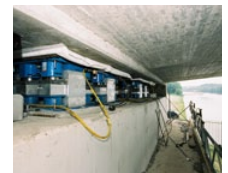
Maas Waalkanaal (NL)