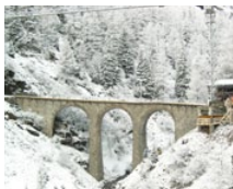
Val da Pila (CH)