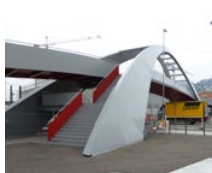
Gleisbogen Bridge (CH)