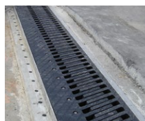
Sliding finger joints