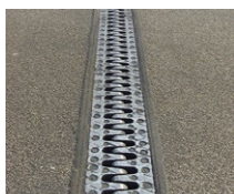
Cantilever finger joints