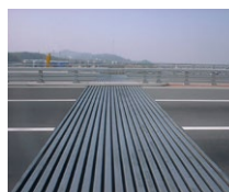
Modular expansion joints