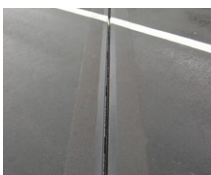
Single gap joints