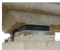
LASTO®LRB & HDRB