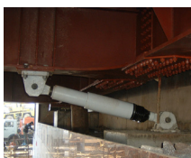
RESTON®SA & STU