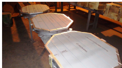
Illustration of a TENSA®GRIP single gap expansion joint, showing its strong anchorages.

RESTON®POT bearings as manufactured, ready for installation.