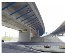
Pont sur le Buron (CH)