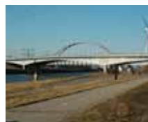
Dintelhaven Bridge (NL)