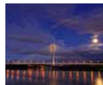
River Suir Bridge (IR)