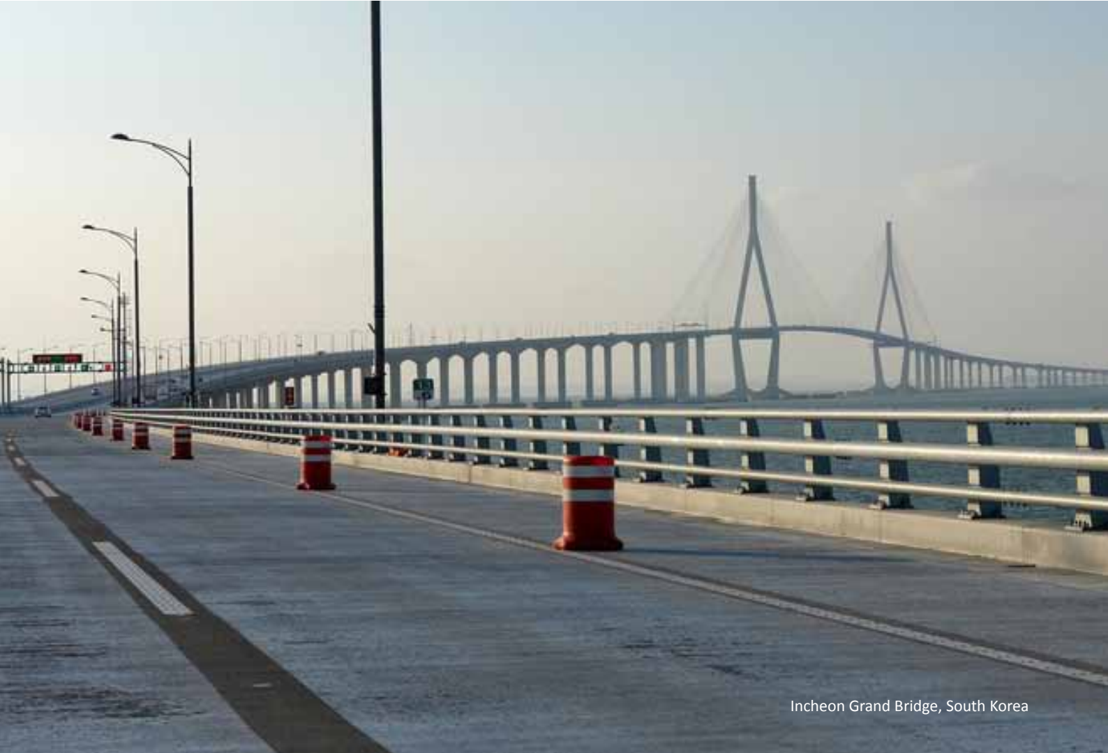
Incheon Grand Bridge, South Korea