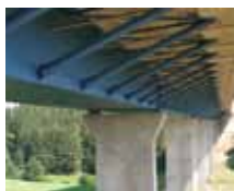
Steinbachtal Bridge (DE)