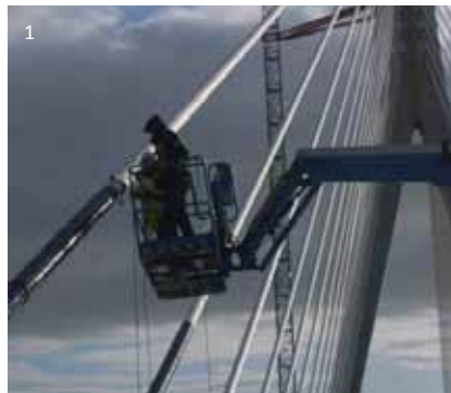
1 Installation of sensors on a cable stayed bridge