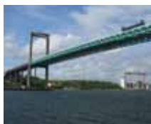
Alvsborg Bridge (SE)