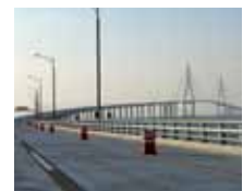
Incheon Grand Bridge (KR)