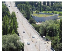
Europe Bridge (CH)