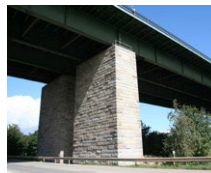
Danube Bridge Sinzing (DE)