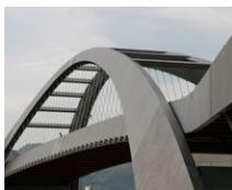
Gleisbogen Bridge (CH)