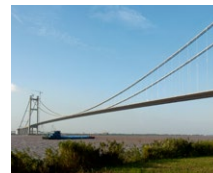
Run Yang Bridge (CN)