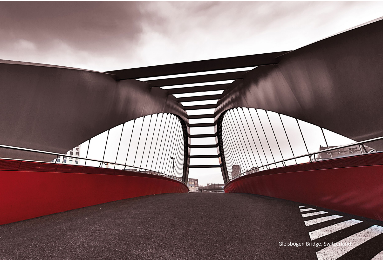
Gleisbogen Bridge, Switzerland