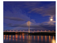
River Suir Bridge (IR)