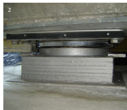
1 KE bearing showing dust protection apron and movement indicator, ready for installation 2 Installed KA bearing with dust protection apron temporarily removed