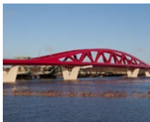
Ijssel Bridge (NL)