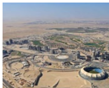
Dubai Sports Complex (AE)