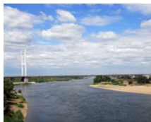
Irtys River Bridge (KZ)