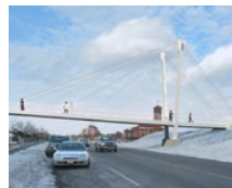
Revere Bridge (US)