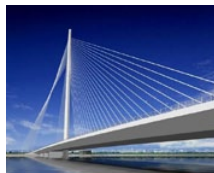
Da Nang Bridge (VN)