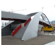
Gleisbogen Bridge (CH)