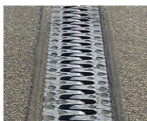
Cantilever finger joint