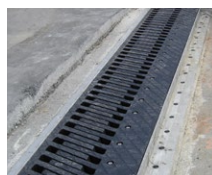
Sliding finger joints