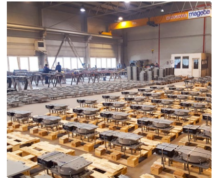
mageba in house production facility of structural bearings