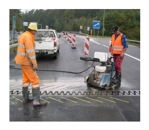
Cutting of slits at a 45° angle to the driving direction

On our website, mageba-group.com , you will find further product information, including reference lists and tender documentation.