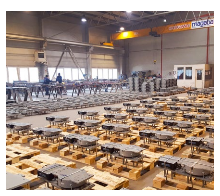
mageba in house production facility of structural bearings