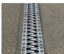
Cantilever finger joints