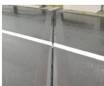
Single gap joints