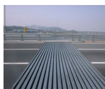
Modular expansion joints