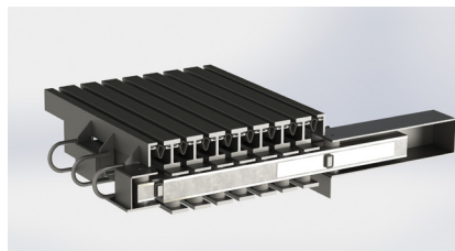
3D rendering of a TENSA®MODULAR expansion joint

The joints were designed and fabricated in accordance with AASHTO LRFD Bridge Construction Specifications, and hot-dip galvanized in accordance with ASTM A123.