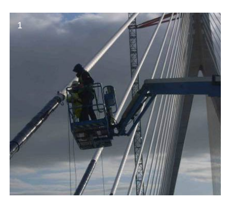
1 Installation of sensors on a cable stayed bridge