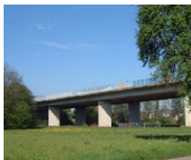
Ohrntal Bridge Öhringen (DE)