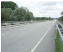
Inn Bridge Simbach (DE)