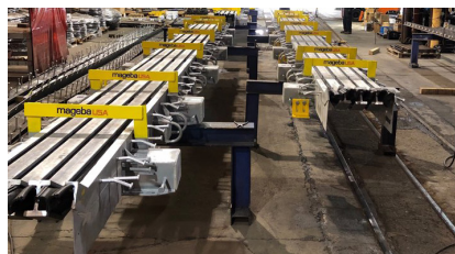
TENSA®MODULAR LR4 joints during assembly

The mageba expansion joints were fatigue tested according to the AASHTO Appendix A19, but instead of the 2 million cycles required by AASHTO, the load cycles were increased to 10 million.