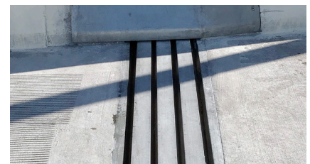
One of the modular joints in service