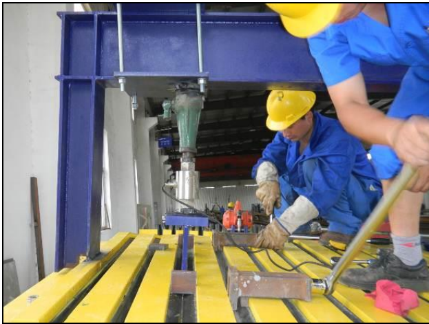
Figure 8 - Seal push-Out (SPO) Test in accordance with NCHRP Report 467

rigors of an OMV test, and thus simulates the weakened condition that an elastomeric seal may exhibit after years of service.