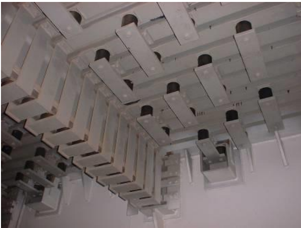
Figure 2 - Single support bar system (1990)

The new type of expansion joint quickly became popular in Switzerland, Germany and Austria – countries which shared a language and strongly developed engineering and transportation sectors. In order to maximize the efficiency of developing industries and the benefits of emerging technologies to their economies, national standardization boards were established to regulate many engineering products and services, and the supply of bridge expansion joints was no exception. The German standard TL/TP-Fü [2] was first released in 1992, and quickly became a benchmark internationally. This well-established standard applies where demands are unparalleled in certain respects, on the country's extensive Autobahn (motorway) network - on many parts of which no speed limit applies, and where modular joints are used almost exclusively. The Austrian standard RVS [3], which came into effect for all Austrian highway structures in 1999, regulates the design and fabrication of several types of joint which are favored on Austrian highways, including modular joints. The requirements relating to modular joints are comparable to those contained in the German equivalent.