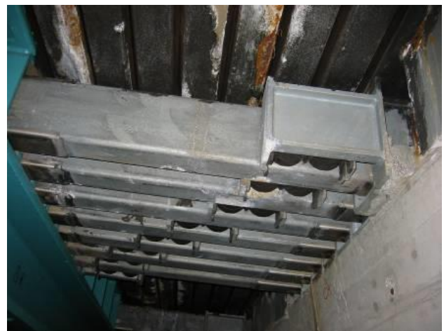
Figure 1 - Multiple support bar system (1970)

But the lack of national standards for the new type of joint did not stifle its growth in popularity across Europe, with early successes encouraging rapid development of the technology. Indeed, the multiple support bar system (whereby each centerbeam (lamella beam) at the surface of the joint was supported by its own support bars) subsequently gave way to the single support bar system (whereby all centerbeams are supported by each support bar, thus reducing the number of support bars required and increasing flexibility) – see Figures 1 and 2.