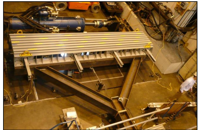
Figure 9 - View from above of conducted seismic testing

Following completion of this testing, and after inspection of the expansion joint confirmed that it had not suffered any significant damage, Caltrans could be satisfied that the expansion joint type meets current Caltrans seismic testing requirements.