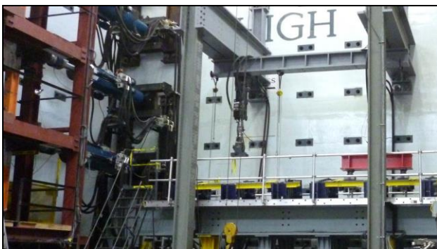
Figure 6 - Fatigue testing of joints (yellow) per NCHRP Report 402

Such a series of tests can require over six months of non-stop use of a test rig, and the testing facilities which are widely recognized as being capable of conducting the testing are very few. This means that such testing, if properly conducted, is very expensive, and must be planned well in advance to allow the testing to be conducted within a project's timeframe.