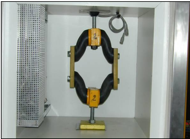
Figure 5 – Testing of the control springs (4 no.) of a modern modular joint at -4 °F (-20 °C). These control the movements of a joint's centerbeams relative to each other, ensuring that no gap becomes too wide

If the steel members themselves are made from single rolled sections rather than welded, they can be relied upon to perform as designed, making testing of these parts unnecessary. However, sections of a centerbeam are often butt-welded together – either in the factory to achieve a change of gradient, or on site to assemble a joint which was transported in parts for logistical reasons. Testing of such butt welds is therefore also necessary in order to achieve the above-mentioned national general approvals.