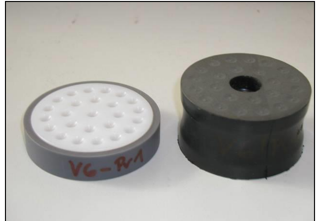
Figure 3 – A sliding bearing and a sliding spring of a modern modular expansion joint – used as a pair (above and below beam) to control the position of a centerbeam or support bar while allowing it to slide

testing is limited to the parts and components of a joint which can be expected to prove problematic. These would include, for example, the sliding bearings and sliding springs (Figures 3 and 4) of some systems which allow the centerbeams to slide across the support bars below, and the elements which control the gap widths between the individual centerbeams as the whole joint opens and closes (Figure 5) [4].