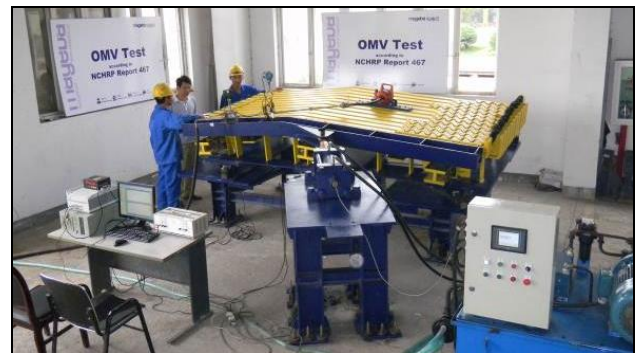
Figure 7 - Opening Movement Vibration (OMV) Test per NCHRP Report 467

Following the publication in 1997 of NCHRP Report 402, which addressed fatigue performance only, the need remained for a second report to address all other aspects of the performance of modular joints. In 2002, the above-mentioned NCHRP Report 467 was issued, commenting on the contribution of Report 402 in addressing fatigue problems and noting: "The research described in this report focused on the remaining performance problems". Two types of test are defined, which are recommended to be required for prequalification for use on a project: the Opening Movement Vibration (OMV) test and the Seal Push Out (SPO) test. The tests are carried out on a full-scale section of the modular joint type which is to be prequalified. The OMV test (Figure 7) simulates, on the one hand, the opening (and closing) movements that can be expected to occur during a 75-year lifetime due to daily thermal cycles (i.e. one opening and one closing movement per day) – and thus features 27,400 cycles. At the same time, the test simulates the vibrations caused by traffic, with a 33 kN force applied to a centerbeam at high frequency for the entire duration of the opening movement testing. Inspection of the tested expansion joint after completion of the test allows the ability of the expansion joint to withstand these principal impacts to be evaluated.