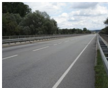
Inn Bridge Simbach (DE)