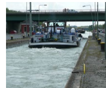
Hindenburg Bridge (DE)