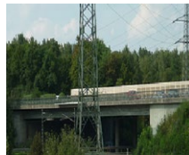
A8 Wendlingen (DE)