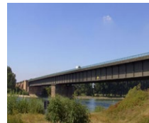
Rhine Bridge Frankenthal (DE)