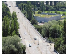
Europe Bridge (CH)