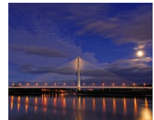
River Suir Bridge (IR)