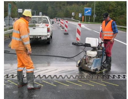
Cutting of slits at a 45° angle to the driving direction

On our website, mageba-group.com , you will find further product information, including reference lists and tender documentation.