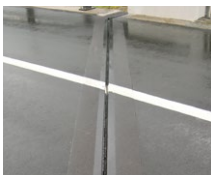
Single gap joints