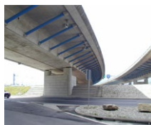
Pont sur le Buron (CH)