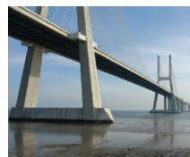
Vasco da Gama Bridge (PT)