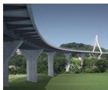
Pont de la Poya (CH)