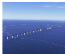
Øresund Bridge (DK/SE)