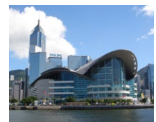
Conference Centre (HK)