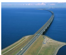
Storebaelt West Bridge (DK)