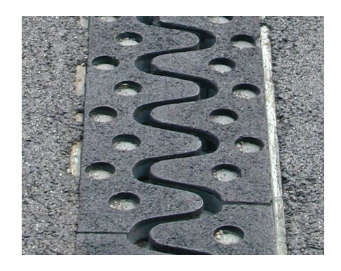
mageba RSFD cantilever finger joint with ROBO®GRIP

On our website, mageba-group.com, you will find further product information, including reference lists and tender documentation.